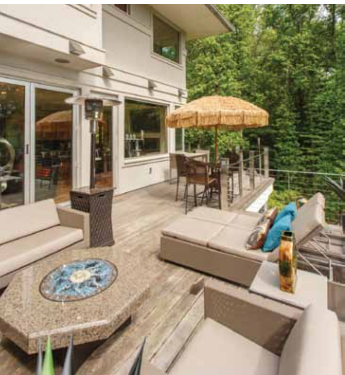
The bedroom's interior trim and hardwood floor are lyptus; tray ceilings were built to house the light fixtures and large windows reveal expansive water views (top). Custom cabinetry, heated flooring and trim (all lyptus) accented by aluminum inlays help to create a hard-versus-soft theme in the kitchen (right), which showcases custom pendant lighting by Carole Crampton. The deck (above) features custom cable rails and lights recessed in stainless-steel posts. Large aluminum doors and windows bring views of the water into almost every room.