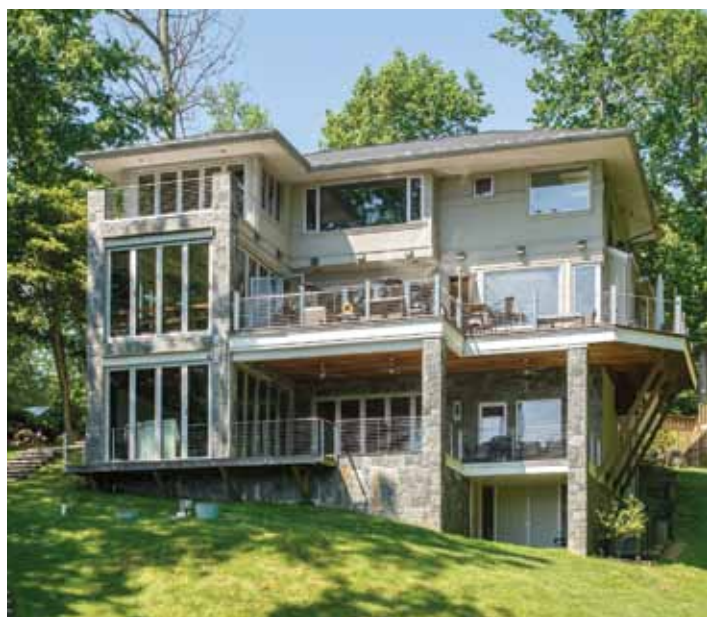
A house clad in stucco and a custom-cut Pisgah stone veneer (above) sits on a challenging site that drops steeply to a flood plain. A wide-open interior (below) showcases the homeowner's art collection in custom wall niches. The stairs are stainless-steel plate stringers with lyptus treads. Other features include a custom four-level elevator and cable lighting.